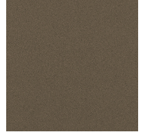
Ancient Bronze - 28 (ABZ)